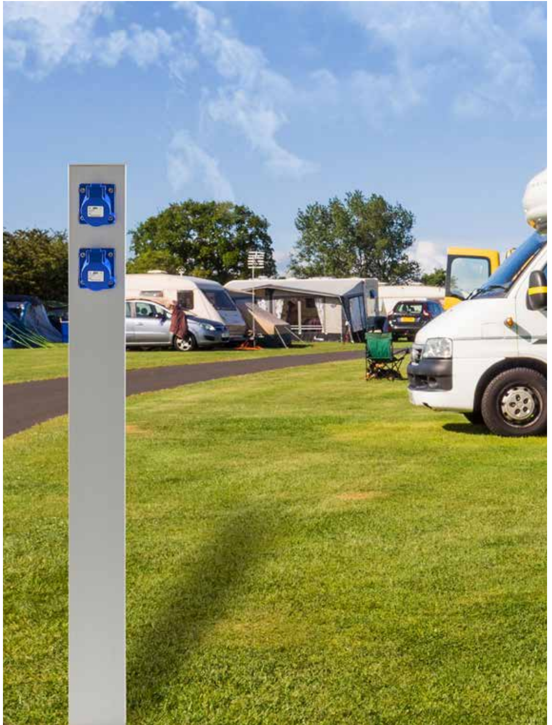
■ Picture shows the column, height 1000mm