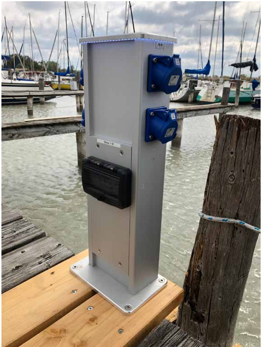
■ Picture shows the column with LED orientation light, height 800mm