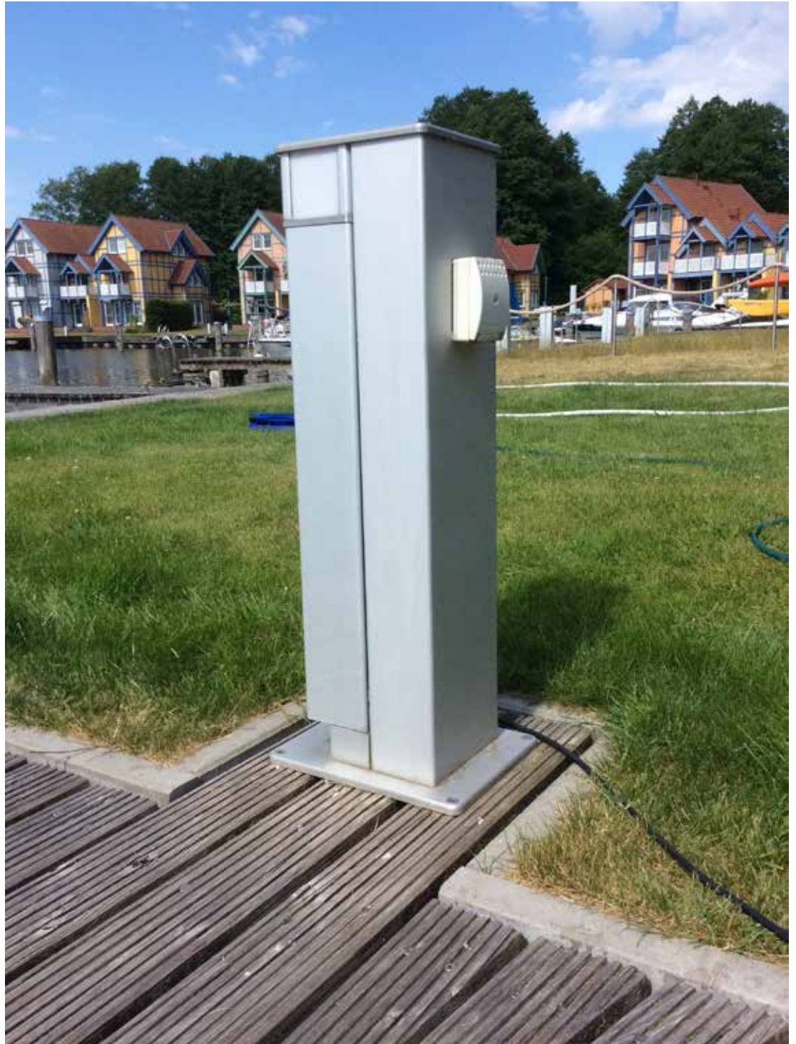
■ Picture shows the column with LED light module, height 1200mm